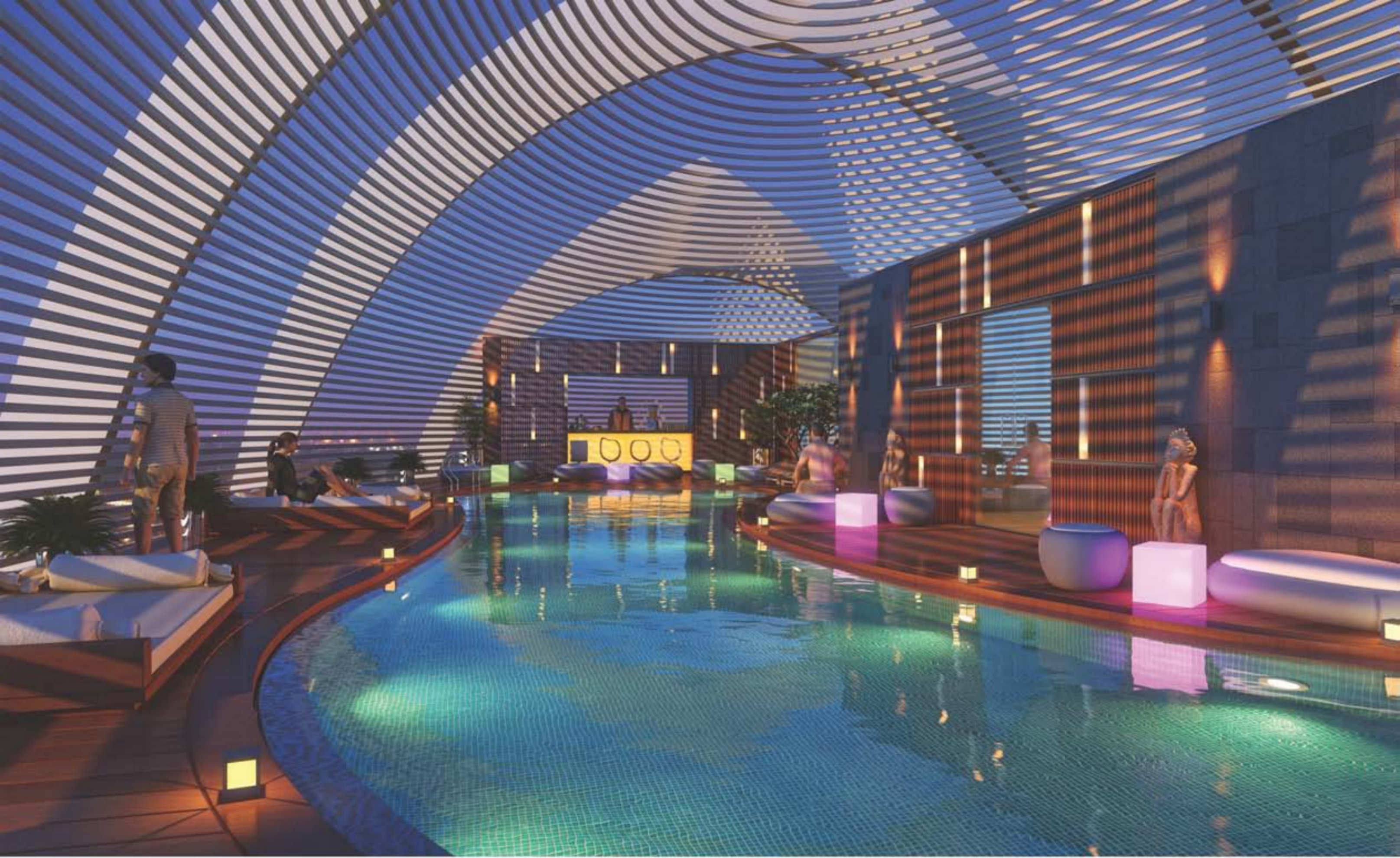
Terrace Plan with Swimming Pool